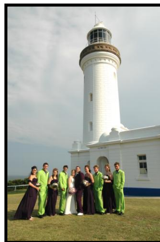
The Wedding Party